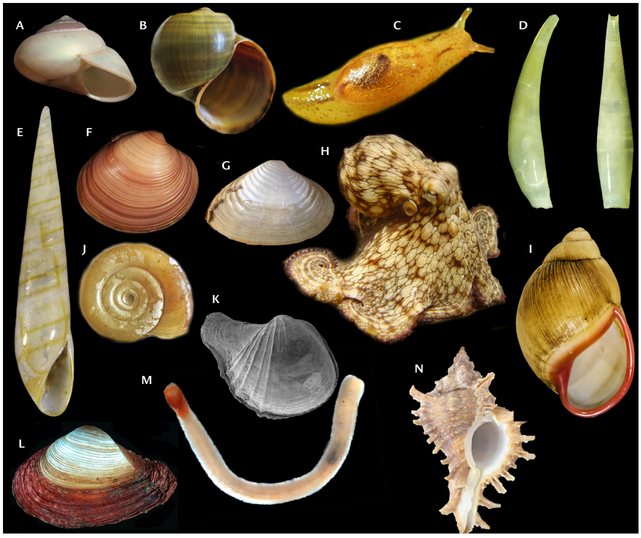
Figure 1. A small fraction of the diversity of shapes and colours of the Brazilian malacofauna: (A) Gaza compta Simone & Cunha, 2006, 19 mm long, marine gastropod, Margaritidae; (B) Pomacea maculata Perry, 1810, ~45 mm long, freshwater gastropod, Ampullariidae; (C) Omalonyx convexus (Heynemann, 1868), 2 cm long, terrestrial gastropod, Succineidae; (D) Gadila pandionis (Verrill & Smith, 1880), 11 mm long, scaphopod, Gadilidae; (E) Eulima bifasciata d'Orbigny, 1841, 8.1 mm long – marine gastropod, Eulimidae; (F) Eucallista purpurata (Lamarck, 1818), ~45 mm long, marine bivalve, Veneridae; (G) Mactrella janeiroensis (E.A. Smith, 1915), 27.7 mm long, marine bivalve, Mactridae; (H) Octopus insularis Leite & Haimovici, 2008, photo by C. Sampaio, ~80 mm long – cephalopod, Octopodidae; (I) Megalobulimus oblongus (Müller, 1774), ~118 mm long, terrestrial gastropod, Strophocheilidae; (J) Biomphalaria glabrata (Say, 1818), ~15 mm long, freshwater gastropod, Planorbidae; (K) Cardiomya minerva Lima, Oliveira & Absalão, 2020, 4.3 mm long, SEM image, marine bivalve, Cuspidariidae; (L) Corbula patagonica d'Orbigny, 1846, ~14 mm long, marine bivalve, Corbulidae; (M) Scutopus variabilis Passos, Corrêa & Miranda, 2021, ~12 mm long, aplacophoran, Caudofoveata; (N) Chicoreus brevifrons (Lamarck, 1822), ~40 mm long, marine gastropod, Muricidae.

microplastic pollution (Schaeffer-Novelli 1990, Migotto et al. 1993 Wang et al. 2021), trawling (Rogers et al. 2022), shell collecting (Zhang and Wu 2020, although that activity can