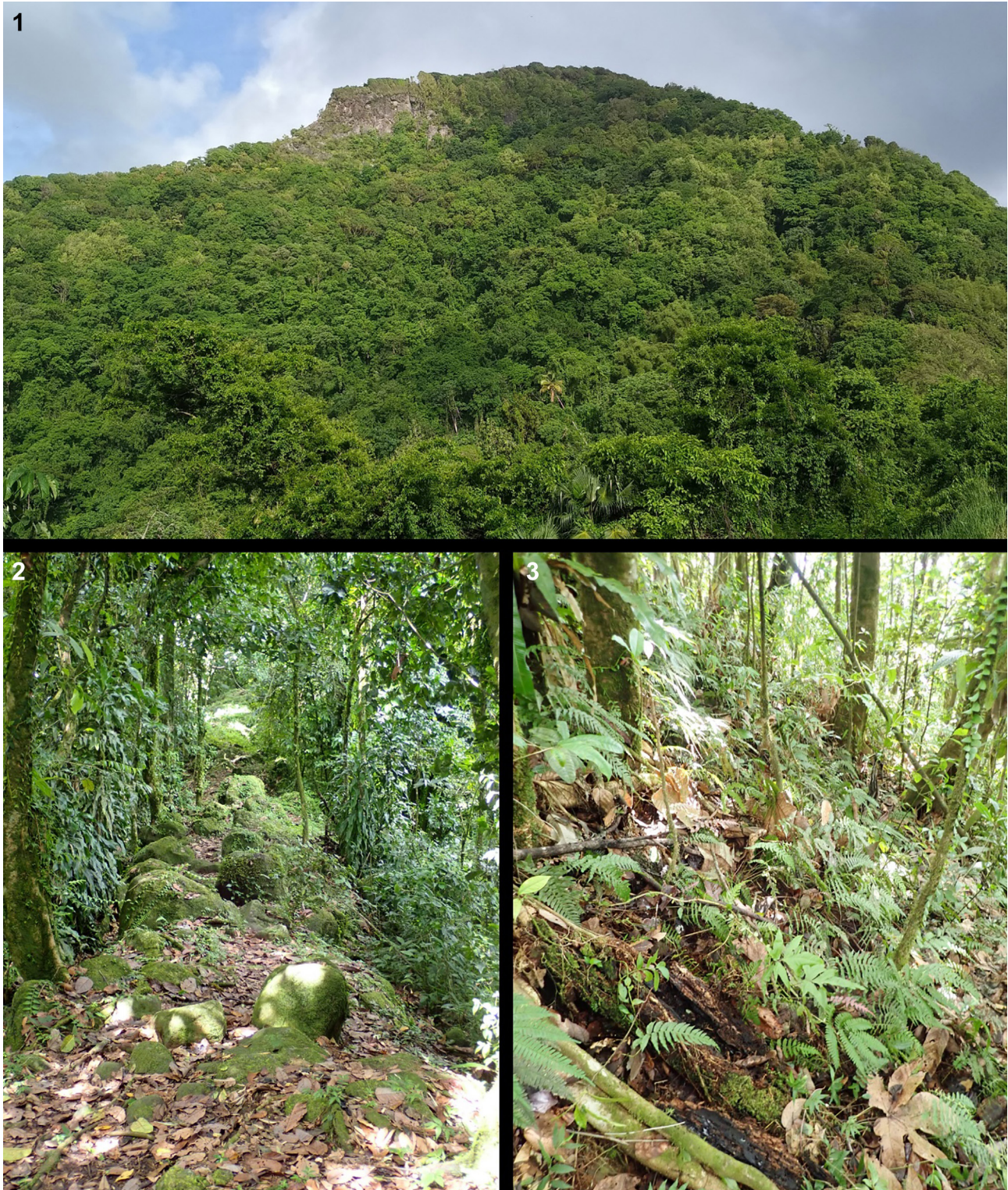
Figs 1–3. Collection site: 1 – overview of the top of Mount Vauclin (photo by E. POIRIER); 2 – the mesophyllous forest of top Mount Vauclin (photo by T. RAMAGE); 3 – place where the specimens were collected (photo by T. RAMAGE)

France) and consist of dry empty shells collected from ground sieving by the second author during a one-day trip to Mount Vauclin.